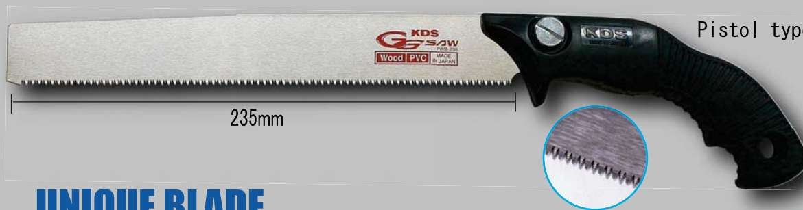
Pistol type grip